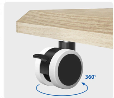
LOCKABLE 360° ROLLER