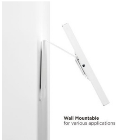
Wall Mountable for various applications