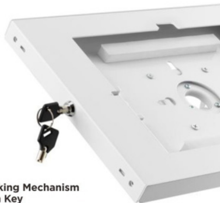
Locking Mechanism with Key protection from theft or vandalism