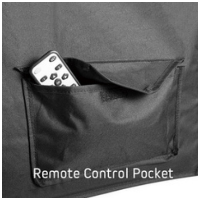
Remote Control Pocket