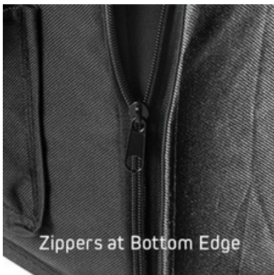
Zippers at Bottom Edge