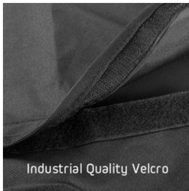
Industrial Quality Velcro