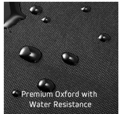
Premium Oxford with Water Resistance