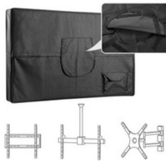
Fits on Most TV Wall Mounts