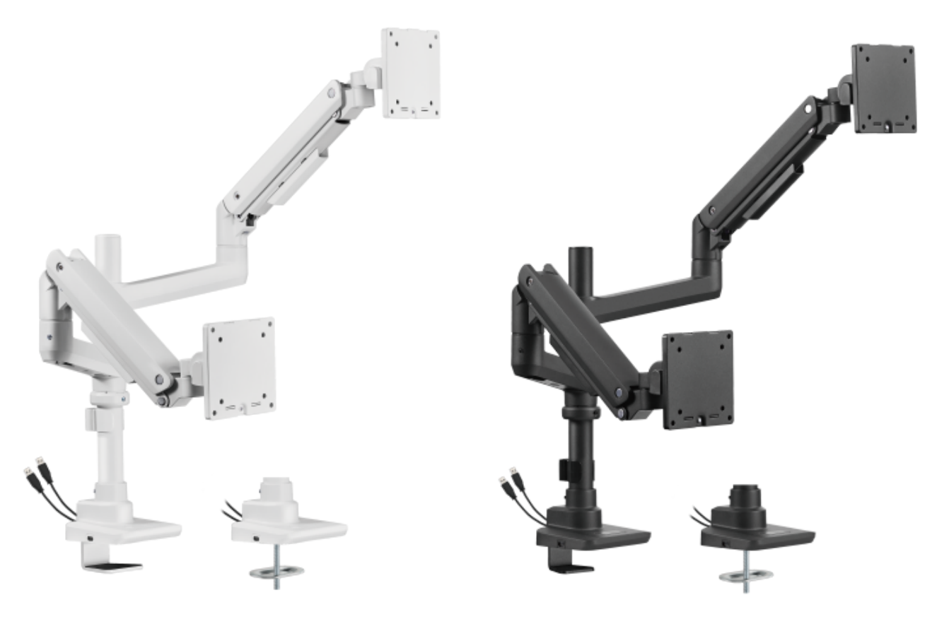
Optimized Head Tilting Structure smoother adjustment for large screens