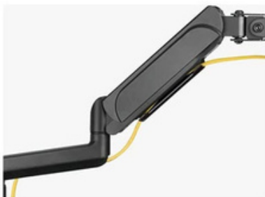
Built-in Cable Management keeps wires organized for a clean look