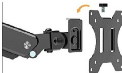
Detachable VESA Plate makes installation a click